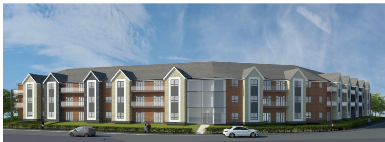
CGI of the proposed scheme at Swan Street, Netherton

Some of the properties are specifically designed to meet the needs of people with physical or learning disabilities and/or support needs, others are for general need.