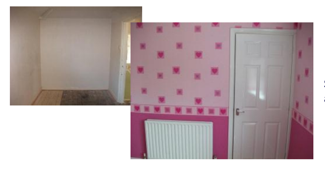
Second bedroom before and after

On the day Stan went to see the finished property, the tenant was passing and asked if she could have a look round before she moved back in and she was very pleased with the work that had been done.