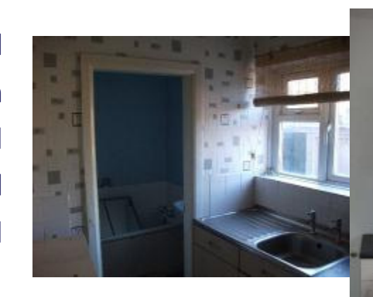
Kitchen before and after

See photos before and after the modernisation was done. The tenant did not want the kitchen tiled because she said she would tile it herself.