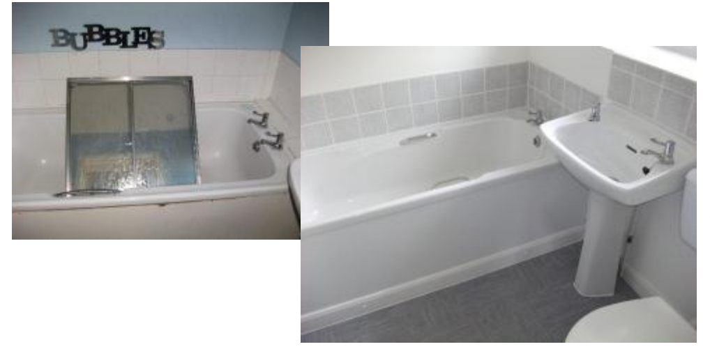
Bathroom before (downstairs off kitchen) and after (re-located upstairs)